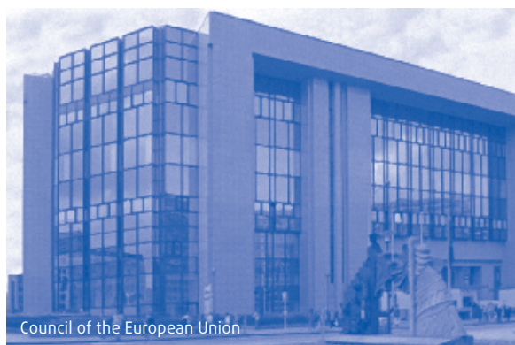
Council of the European Union

In order to ensure continuity in its work, the Council works on the basis of a common 18-month programme established by trios of successive Presidencies .