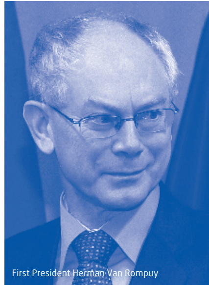
First President Herman Van Rompuy

The European Council meets at least twice a year, usually at the headquarters of the Council of the European Union in the Justus Lipsius building in Brussels. Since beginning of 2012, the European Council has been meeting more often to discuss and agree on EU action in response to the crisis.