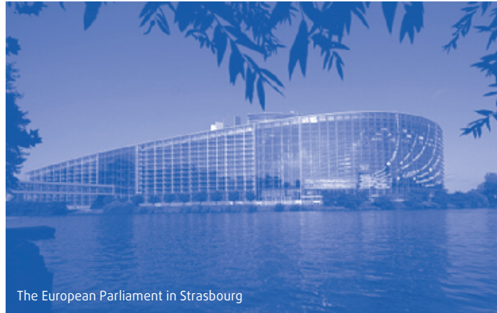
The European Parliament in Strasbourg