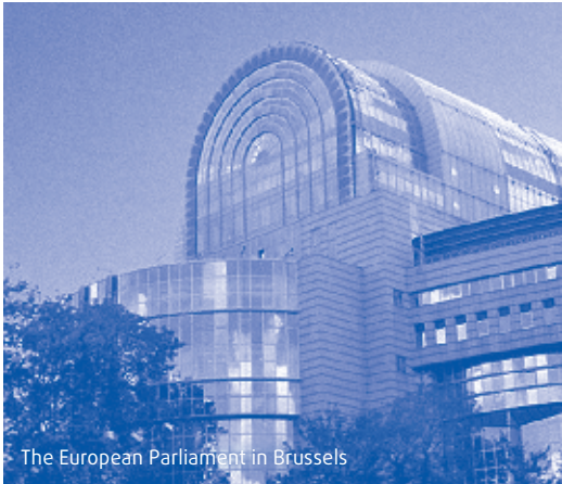
The European Parliament in Brussels